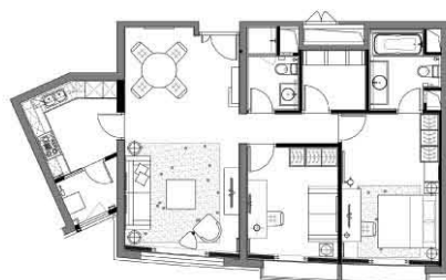
Two Bedrooms Residence