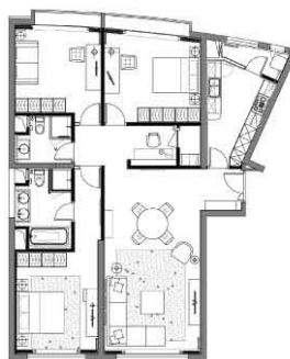
Three Bedrooms Residence