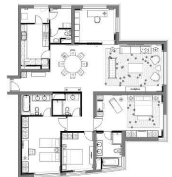
Three Bedrooms & Study Residence