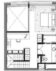
Duplex Loft Residence